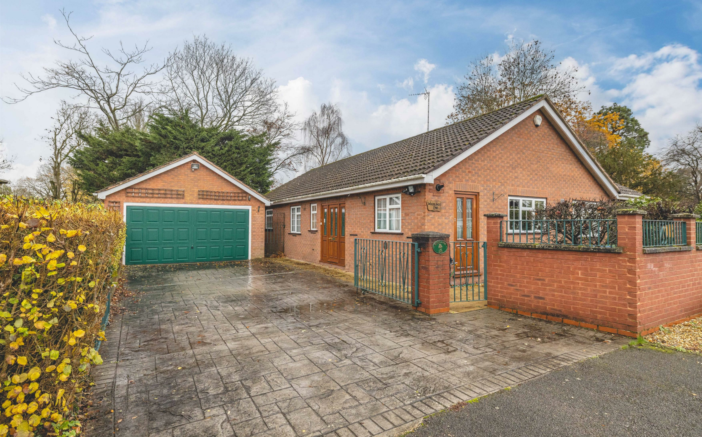
Woodlands End Woodland Avenue, Windsor, SL4 4AG £835,000